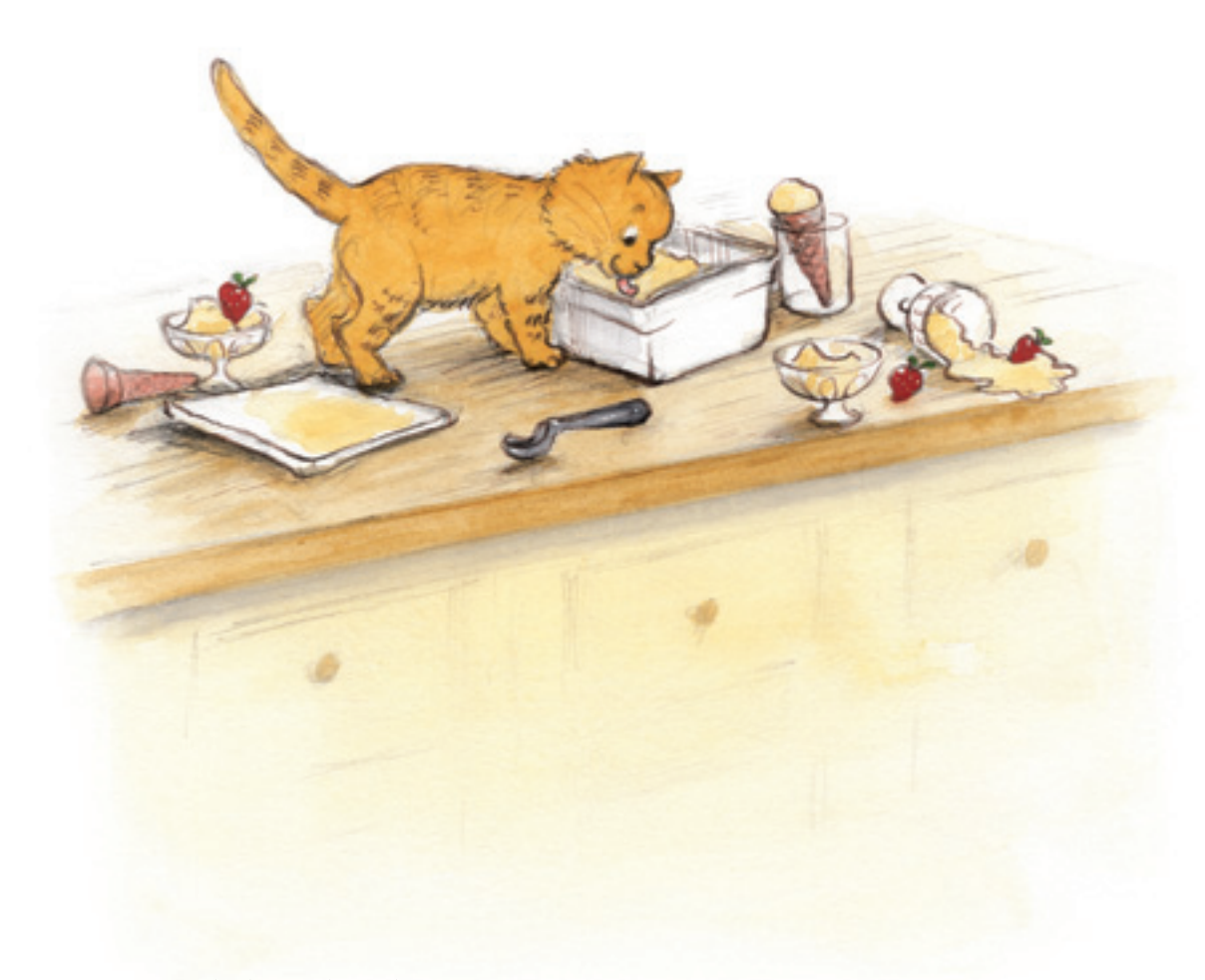
He liked the ice cream. Gobble, gobble.