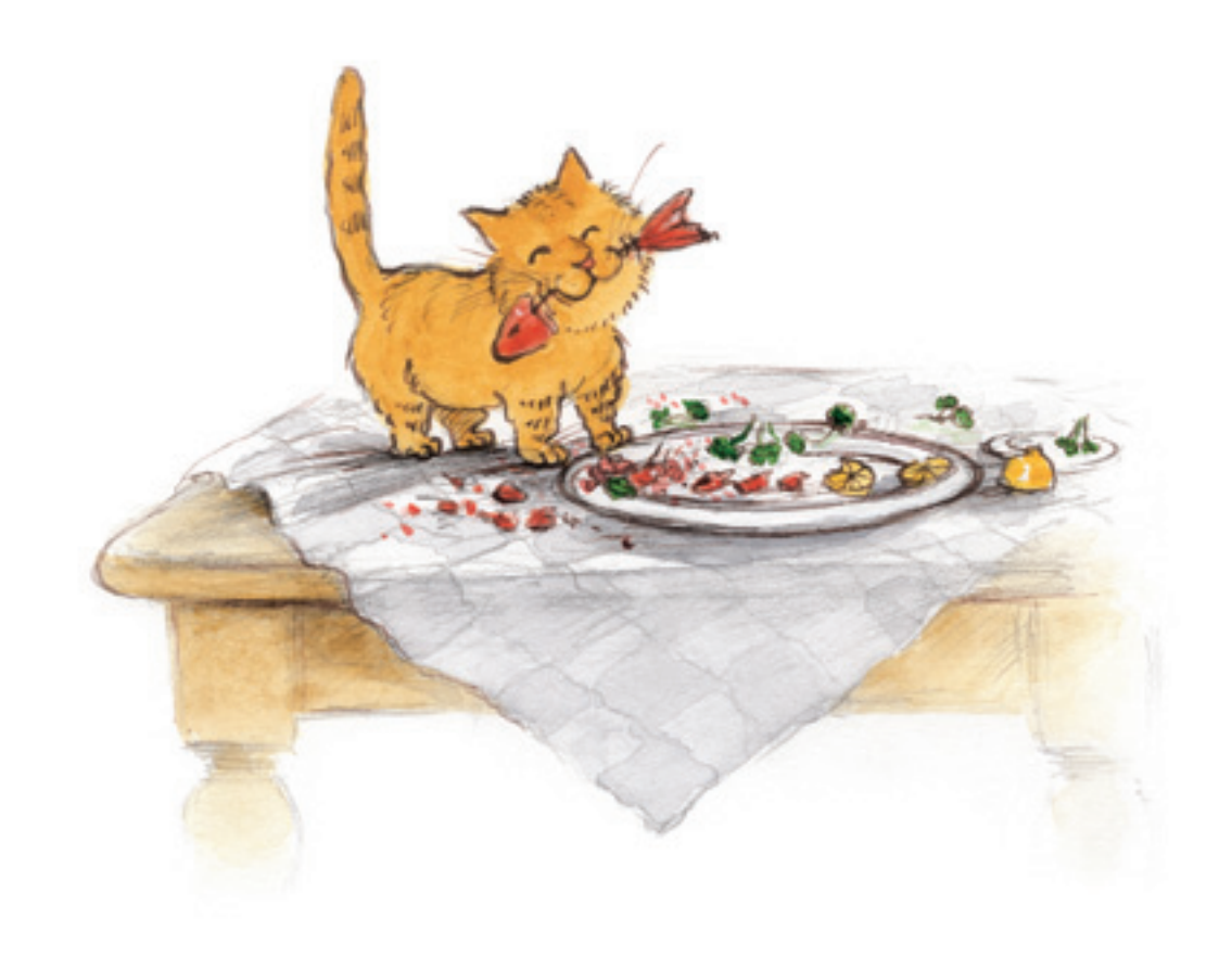
The new cat jumped on the table.