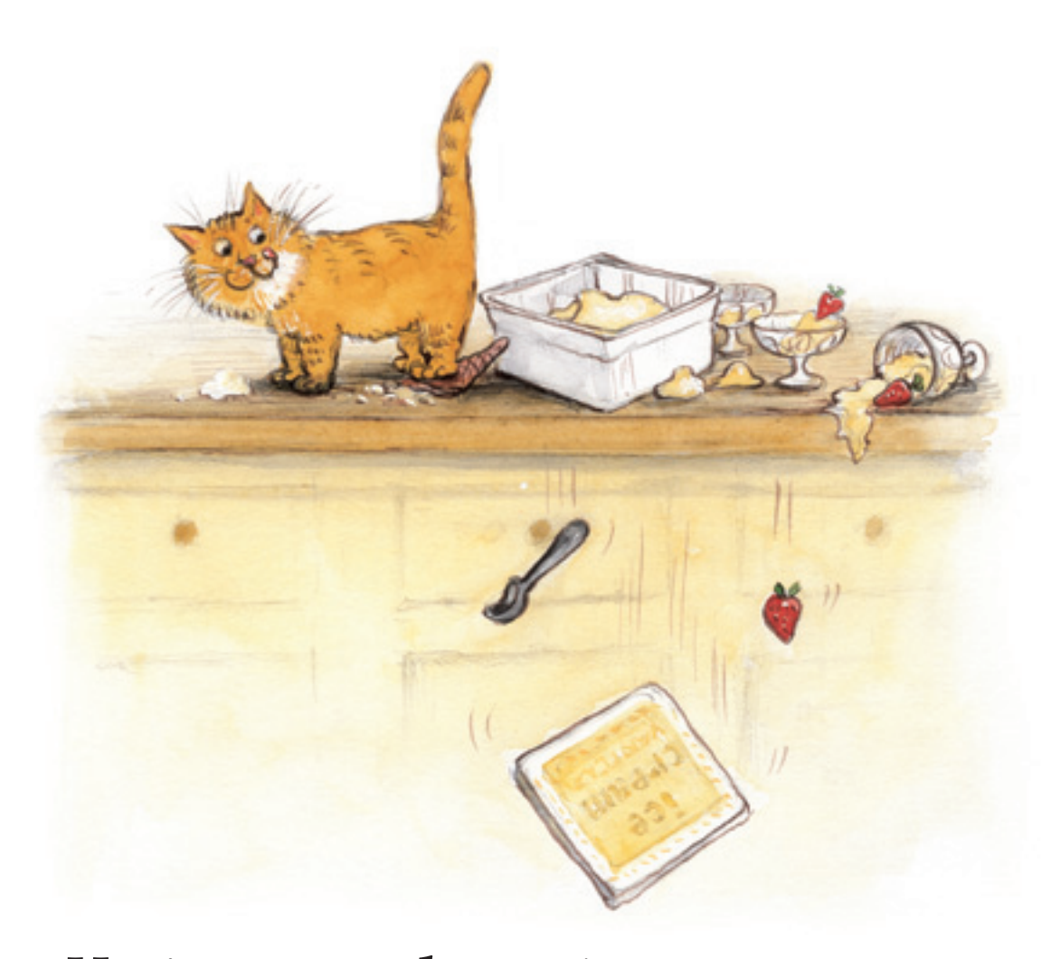
He is a greedy cat!