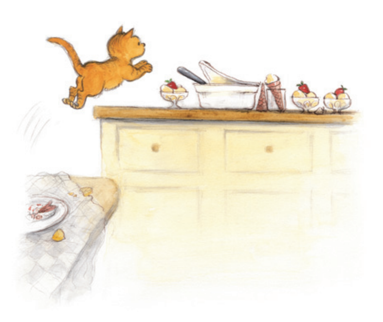
The new cat jumped on the bench.